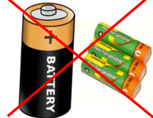
Batteries of any kind