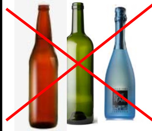
Brown, Green or Blue Glass